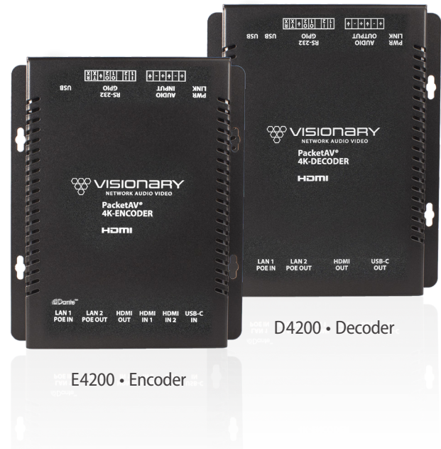
E4200 • Encoder

With the growing demand for 4K UHD video, professional AV designers and IT directors – in an increasingly converged AV/IT environment – have been using Visionary's products as an alternative to conventional distribution systems.